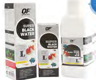
L250ML L120ML L1L