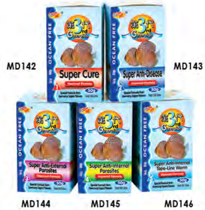
MD142 MD143 MD144 MD145 MD146