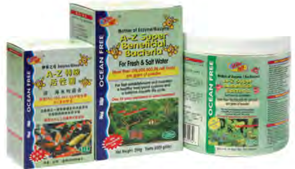
MD026 MD027 MD028