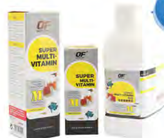
M250ML M120ML M1L