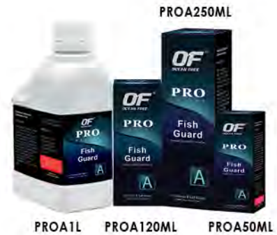
PROA1L PROA120ML PROA50ML