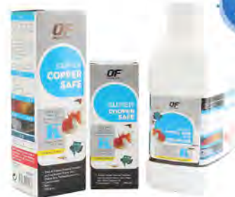
K250ML K120ML K1L