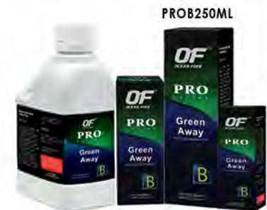
PROB1L PROB120ML PROB50ML