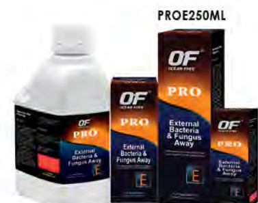
PROE1L PROE120ML PROE50ML