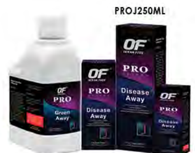
PROJ1L PROJ120ML PROJ250ML