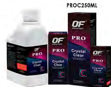
PROC1L PROC120ML PROC50ML