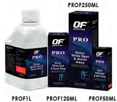
PROF1L PROF120ML PROF50ML