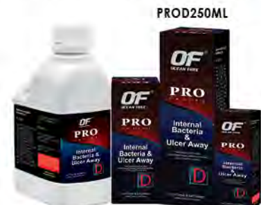
PROD1L PROD120ML PROD50ML