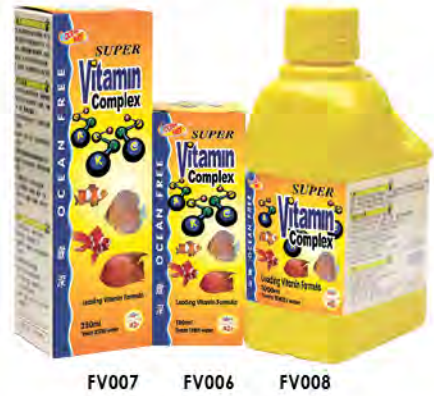
FV007 FV006 FV008

Ocean Free Multi-Vitamin Complex is the most stable and complete multi-vitamin complex in the market. It contains all the essential vitamins for all aquatic live form. It also encompasses calcium with trace elements / minerals added. Through high technology processing. It is highly absorbable through fish's mouth, gills and skin. This is a 'must have' for all novice and expert hobbyist.