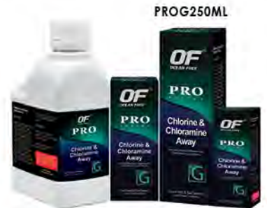
PROG1L PROG120ML PROG50ML