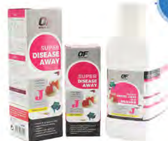
J250ML J120ML J1L